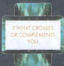
1 YOU / THE SITUATION IN QUESTION